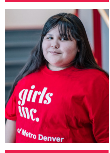
76 girls attended college tours held at 8 campuses