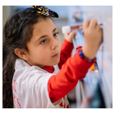
140 healthy living (STRONG), academic (SMART), and leadership (BOLD) programs offered