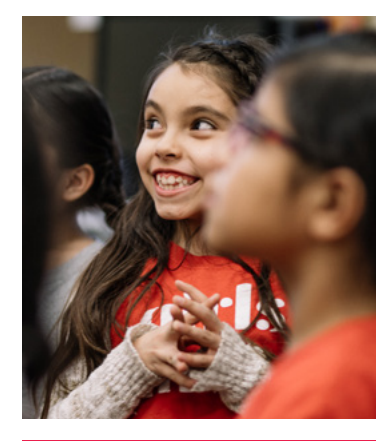
$65,000 awarded in college scholarships