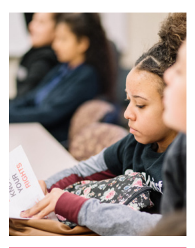
16 daily transportation routes from schools to Girls Inc.