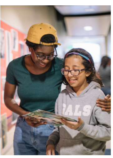
600 guests celebrated the inaugural My Bold Future luncheon